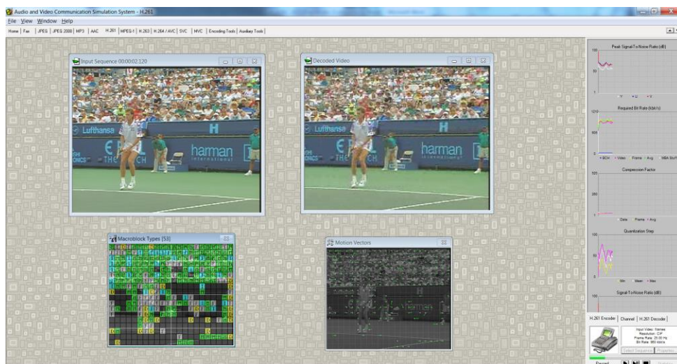
Figure 3 – General view of the application.