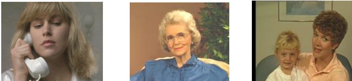
Figure 1 - Typical videotelephony images.

The objective of this lab session about Recommendation ITU-T H.261 is to get the students familiar with many aspects of video compression using the first standard video codec developed for videotelephony and videoconference over ISDN channels at p \times 64 \text{ kbit/s} , with p = 1, \dots, 30 . For that purpose, the application “Audio and Video Communication Simulation System” will be used as it includes among others a H.261 video codec module. Figure 1 shows some examples of typical videotelephony sequences; from these frame examples, it is clear that this type of content has rather specific features, notably face(s) as the main ‘object’, rather static background and simple motion.